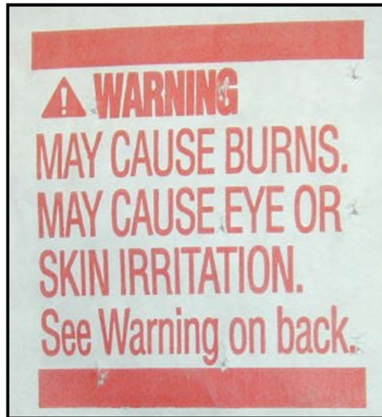
6.1: Burn hazards can be difficult to recognize initially; always be sure to check for posted warnings.