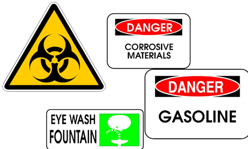
6.2: Each of these warnings must always be heeded when posted at any mine worksite.