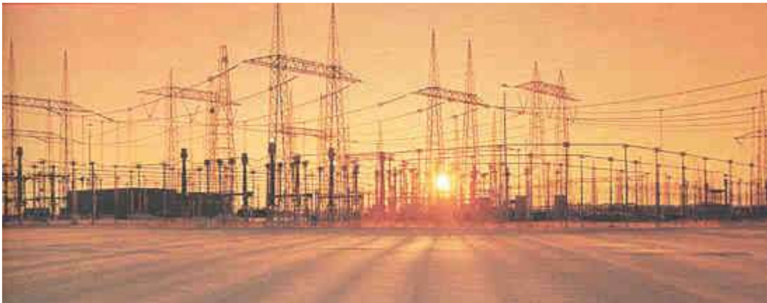
7.2: Example of standard electrical substation.

Additionally, the area around electric substations and transformers should be kept clear of dry vegetation and other materials that could catch fire. This clearance must extend at least 25 feet in every direction.