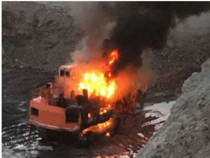
7.4: Active fire in self-propelled equipment.