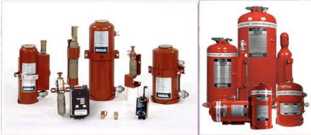
7.3: Sample fire extinguishers.