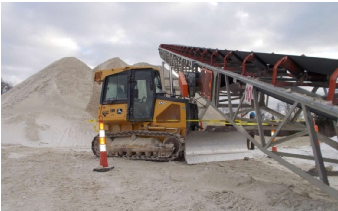
7.1: Conveyor belt used in above-ground mining operations.